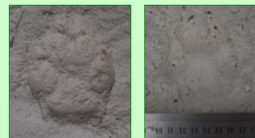
Figure 8. Examples of coyote prints found in gypsum track traps during the surveys.