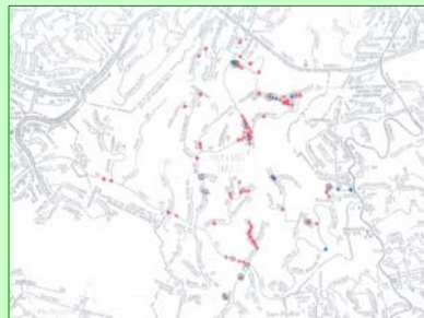
Figure 2. Map of compiled coyote sightings data reported by residents to the City of Rolling Hills from 2003 through 2006. The most reports occurred during 2003 (colored in red).

We then set track traps at seven different locations on the scat-marked trails within the Canyons (Fig. 4) using gypsum. Following an initial spatial survey spanning the entire 400 acres, we then continued with a more intensive, temporal study on a major corridor separating the City of Rolling Hills and the Canyons Reserve. We conducted this temporal study in order to determine the frequency with which coyotes visit the seven areas. We did this over a three-week period, refreshing the gypsum after an unexpected April rain storm. When canine tracks were found, we utilized measurements provided by Lowry (2006) to discern between dog, fox, and coyote prints. Photographs of the prints were sent to James Lowry to confirm our identifications.