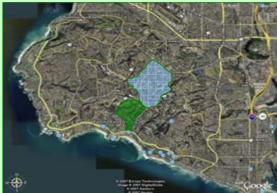
Figure 1. The Palos Verdes Peninsula showing the location of our two study areas, The City of Rolling Hills is outlined in blue and the Portuguese Bend Nature Preserves' Canyons Reserve is outlined in green.

However, no one has documented where the coyotes are and how abundant they are on the Peninsula, or even proven their presence. This study was instigated to scientifically determine the existence of coyotes and where they are most prevalent on the Peninsula (Fig. 1). This initial information will be used to help find solutions to the controversy over coyotes in Palos Verdes.