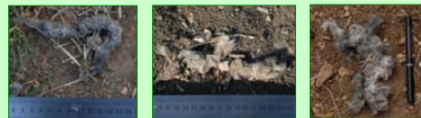
Figure 5. Examples of scat found along trails used to determine the location of one of our gypsum track traps.