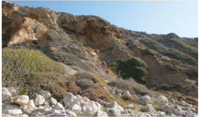
Restoration technicians planting coastal bluff habitat at Pelican Cove

Fall and Winter is a very busy time for restoration efforts and 2011 was no exception. More than 120 cubic yards (54,000 pounds) of invasive acacia trees were removed from Vicente Bluffs and McCarrell's Canyon, and truck loads of fennel removed by volunteers at Portuguese Bend and Lunada Canyon. Staff and volunteers planted over 12,000 container plants to restore 3 acres of coastal bluffs, 1 acre of riparian, 10 acres of coastal sage scrub, 3 acres of cactus scrub, and 1 acre of Palos Verdes blue butterfly habitat.