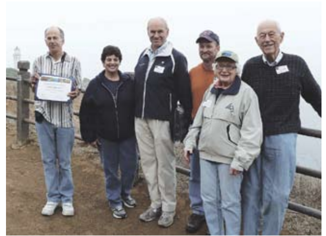
2011 Outstanding Volunteer recipients