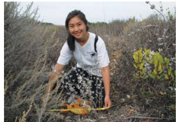
Student sampling for plant carbon uptake on the Palos Verdes Nature Preserve

For forms and additional information please visit: WWW.PVPLC.ORG