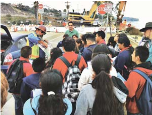
A City of LA Public Works Inspector showing students an aerial map of the landslide area